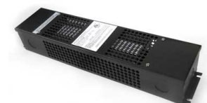
60-100 watt AC dimmable hardwire

Lumicrest's sleek and elegant LED linear lights are available in custom lengths from 20" to 8 feet (50cm-250 cm). The LED lights inside the fixture are powered by low-voltage 24 volts DC, and are powered by a remote-mounted power supply unit via low-voltage wire. All power supplies are class 2, cULus certified units that meet North American safety regulations.