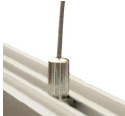
Slides along slot in top of light for easy positioning