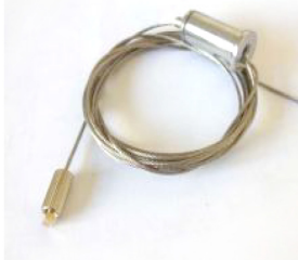
Aircraft cable suspension system (2 included)