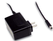
40 watt plug-in