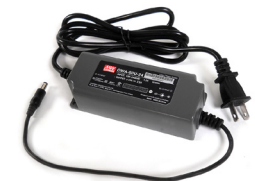
60 watt plug-in