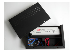
60 watt hardwire