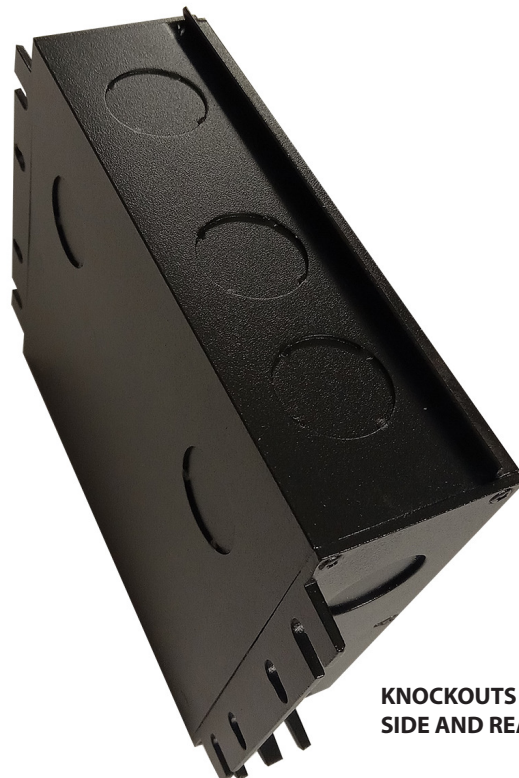
KNOCKOUTS ON FRONT, SIDE AND REAR