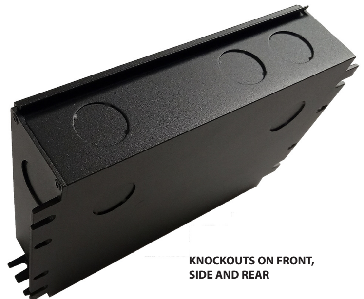
KNOCKOUTS ON FRONT, SIDE AND REAR